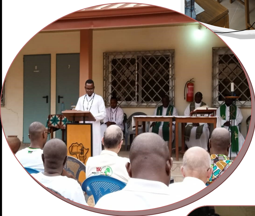
COMMUNITY MASS AT THE PROVINCIAL HOUSE, MAK- ING THE END OF THE PRO- VINCIAL AS- SEMBLY