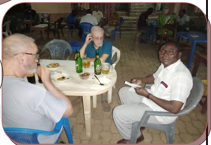
Community meal at the provincial House