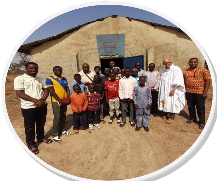
Stagiares and members of Chawa outstation, Minna, Nigeria