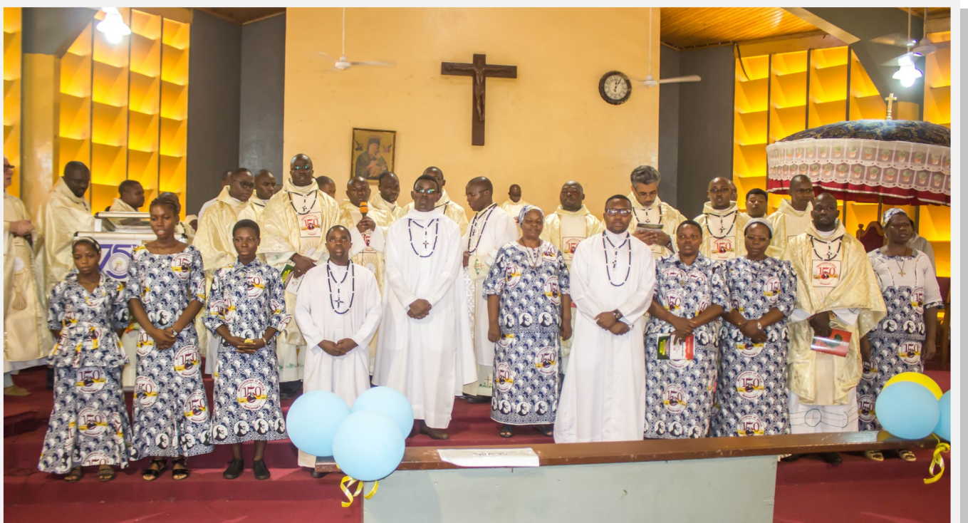
M.Afr. & MSOLA singing Santa Maria