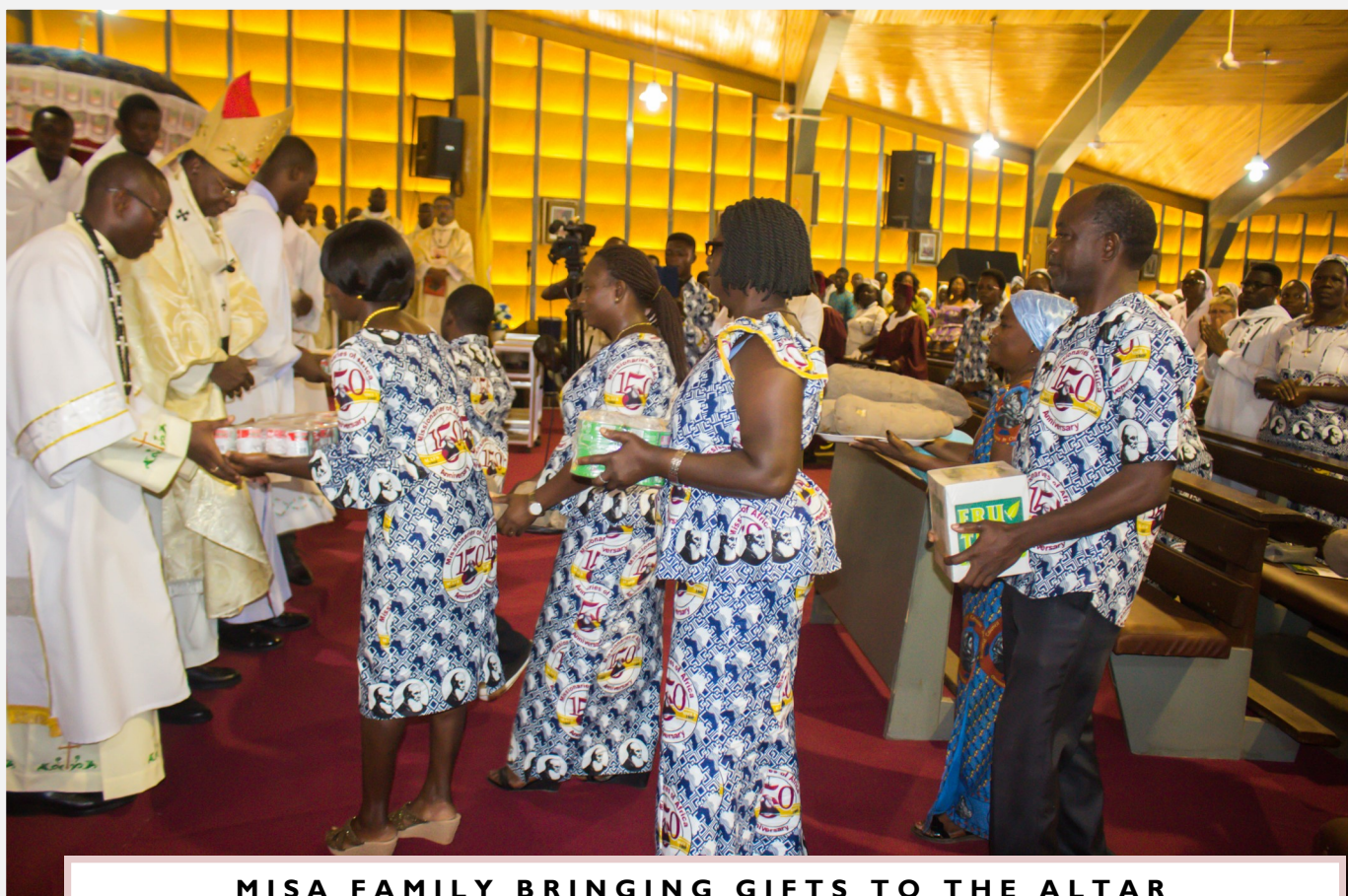
MISA FAMILY BRINGING GIFTS TO THE ALTAR

Dagomba group praised the Lord for the gift of the Missionaries of Africa who brought the Good News to this part of the country while mentioning the names of some of the founding fathers.