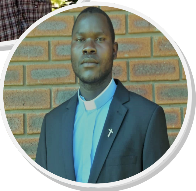
Pierre Channel, Osogbo