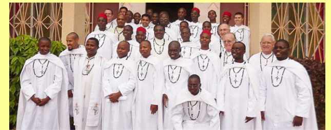
Novices with some confreres in Burkina Faso.