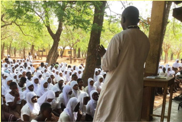
Sensitization on Modern Slavery and Human Trafficking.