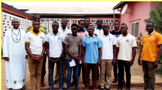
Aspirants with their animators at Morin house, Tamale.

"You will be my witnesses to the ends of the Earth." (Acts 1:8)